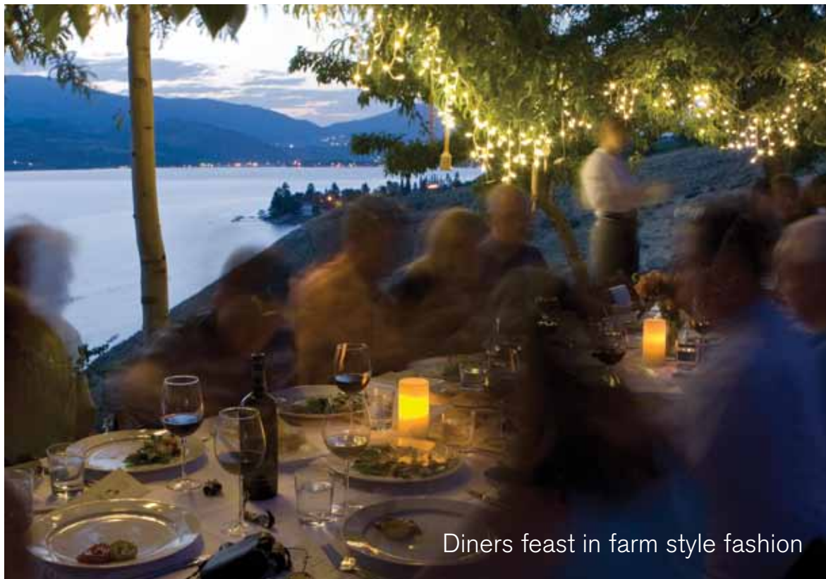
Diners feast in farm style fashion

Saving the best for last is Laughing Stock's Portfolio – Gold medal winner at the Canadian Wine Awards. This is a wine that will snuggle into your wine cellars and become your absolute best friend in a few years. Richly layered it effortlessly enhances the flavours of our next two courses from the succulent roasted lamb, heirloom tomatoes and wild chantrelle mushrooms to the dark chocolate mousse and honeycomb.